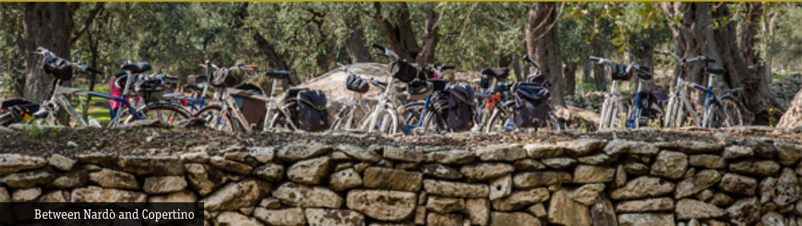
Between Nardò and Copertino