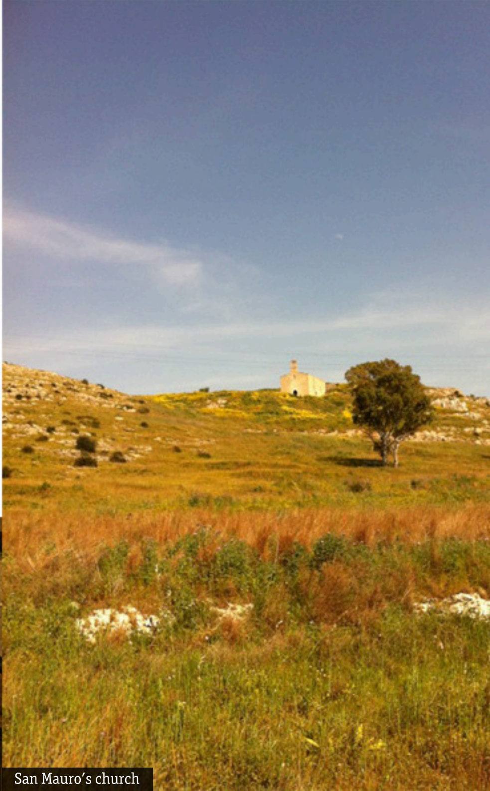
San Mauro's church