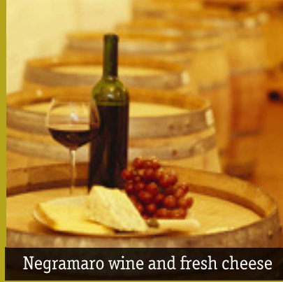
Negramaro wine and fresh cheese