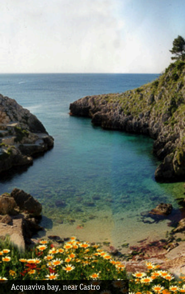
Acquaviva bay, near Castro