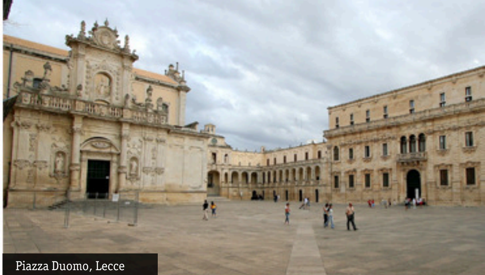
Piazza Duomo, Lecce