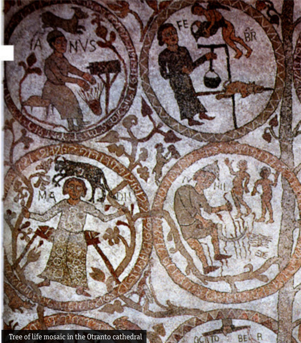
Tree of life mosaic in the Otranto cathedral

Flat route today, with many interesting cultural and naturalistic sights. First we visit Acaya – a fortified city with a huge castle – and then we plunge down to “Le Cesine” – a WWF protected area , crossing point for many species of migratory birds. From there we head towards the coast, along the ruins of Roca Vecchia – an ancient Bronze age city – and ‘Alimini’ Lakes. Some more kilometers and we are in Otranto, where narrow streets reveal wonders at every corner: the St. Peter church Byzantine frescoes, a walk along the ramparts overlooking the sea and finally the cathedral with its paved mosaic , a sort of figurative Middle Age encyclopedia .