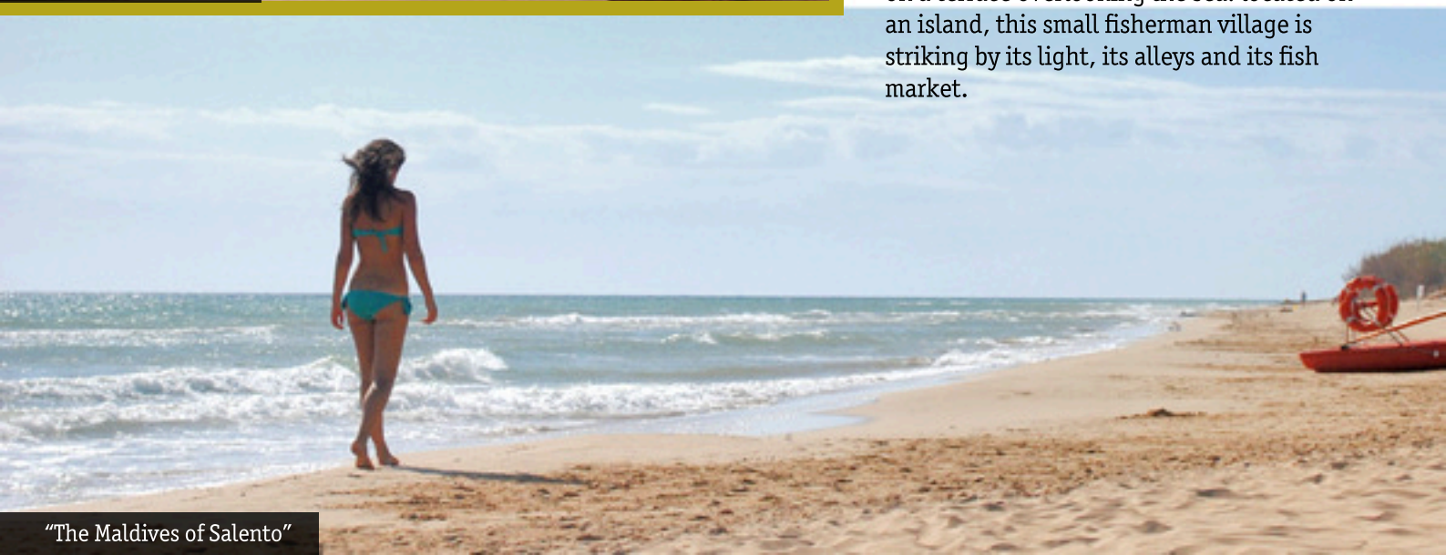
"The Maldives of Salento"