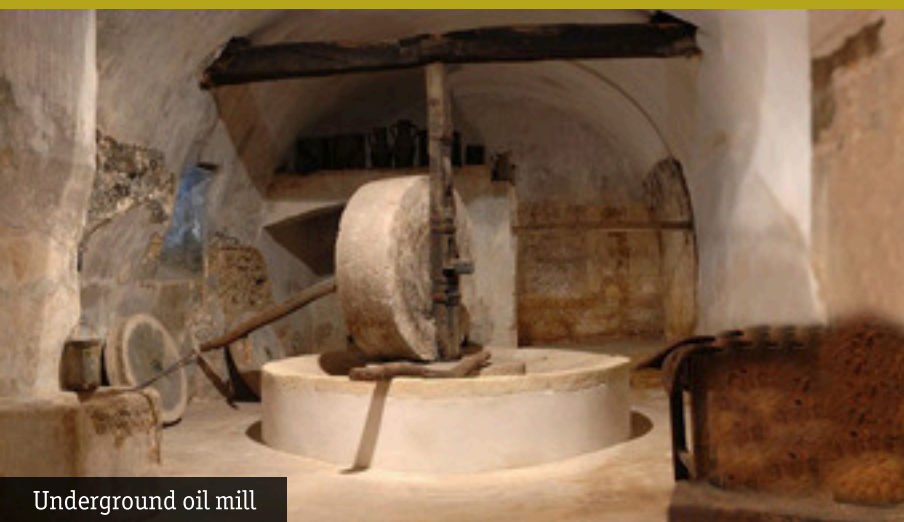
Underground oil mill