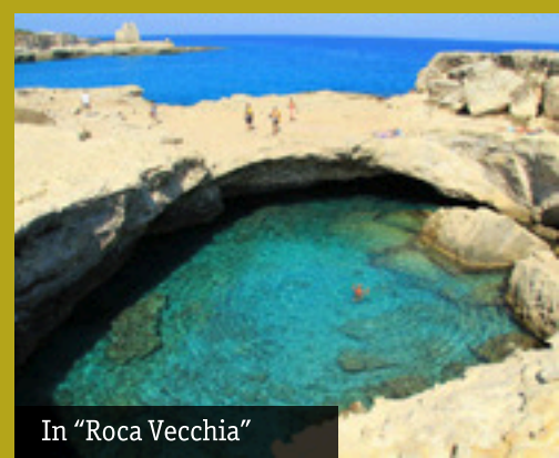
In “Roca Vecchia”