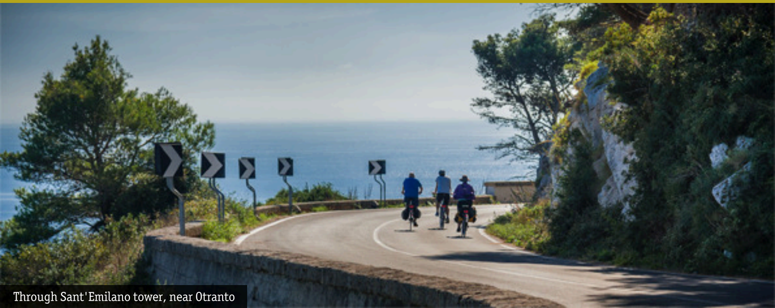
Through Sant'Emiliano tower, near Otranto

You could visit ' Zinzulusa' cave , going down nearly 200 feet into the earth bowels. On the way we admire some terraces and dry walls, the ingenious devices of peasants to get arable land in barren and impervious areas. After crossing the bridge over the "ciolo" (a small and rich in rare flora canyon carved by the waters,) you reach Santa Maria di Leuca where you visit the sanctuary , following the ancient pilgrims footsteps.